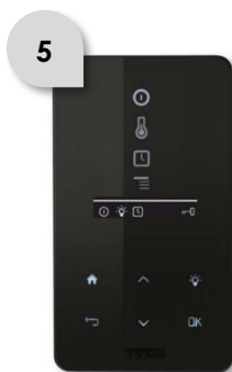
Tylo Control Panel